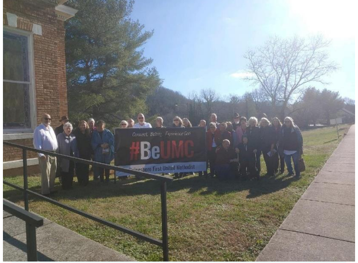
Members of Gainesboro UMC in the Caney Fork River District participating in the #BeUMC campaign.

Our church was chosen to have our photo on the Tennessee-Western Kentucky Conference website, we are honored to represent the United Methodist Church.