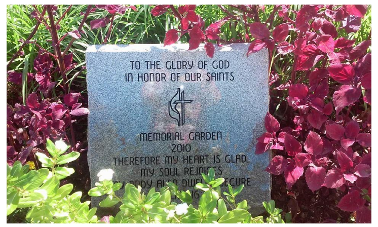
No Memorials for November